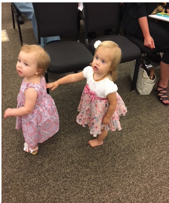
Two up and coming leaders on SWID waiting for the results of the District Superintendent 's vote!