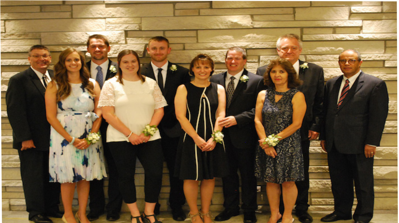
SWID Ordination Class of 2018

July 2018 2018 District Assembly Highlights