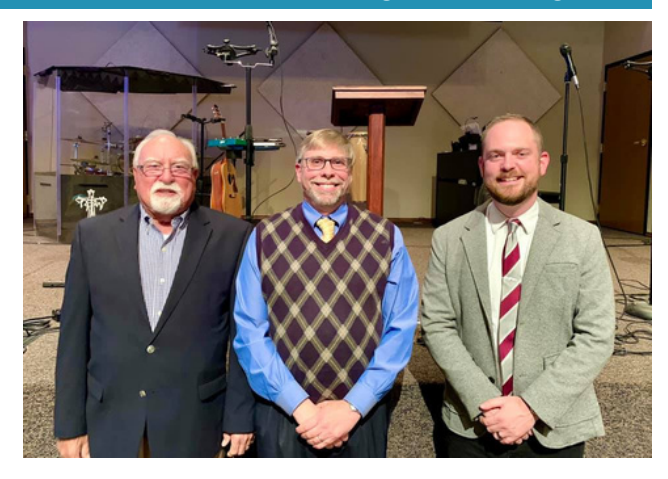
Celebrating The Past, Imagining The Future