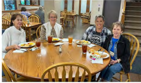
Ladies from Oakland City at Laymen's Retreat