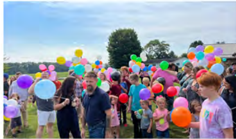
Bicknell Nazarene Homecoming