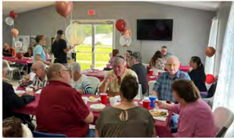
Bicknell Nazarene Homecoming