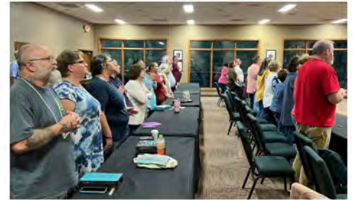
Laymen's Retreat 2022