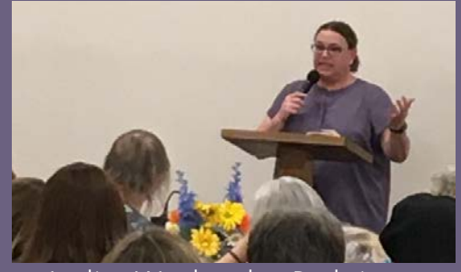
Ladies Weekend at Parkview