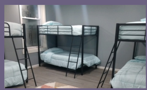
The new Christ's Community Center at Bicknell Nazarene