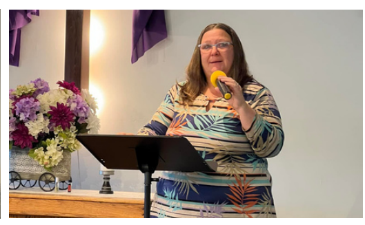
Worship at Crossroads Community