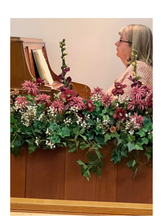
Worship at Salem Nazarene