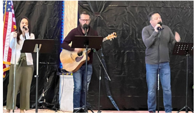
Worship at Point Township