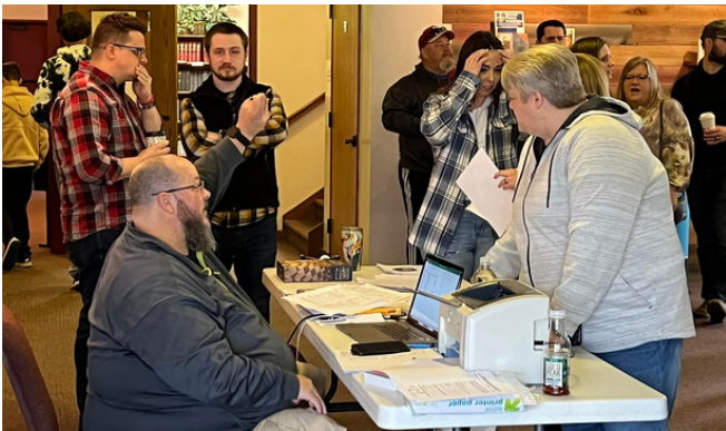
District Celebrate Life at Parkview Nazarene