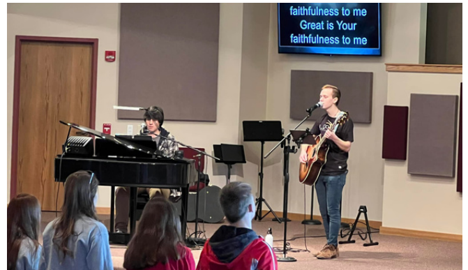
Worship at District Celebrate Life