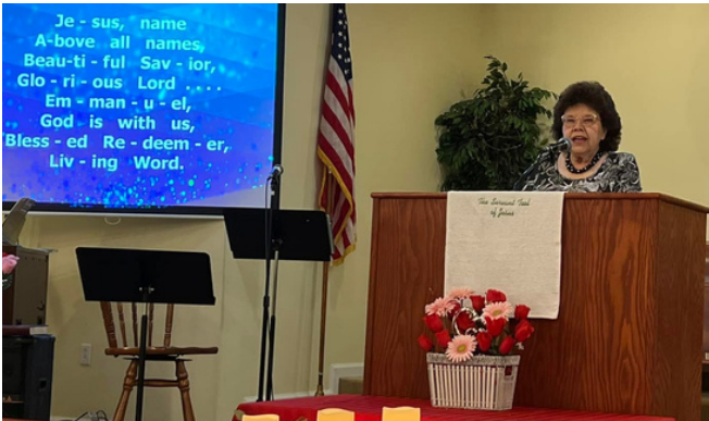
Worship at Georgetown