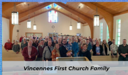
Vincennes First Church Family