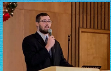
Installed as Lead Pastor on December 8, 2019