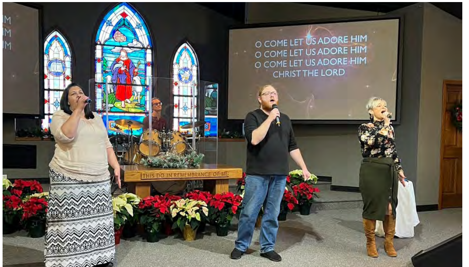
Restoration Praise Team