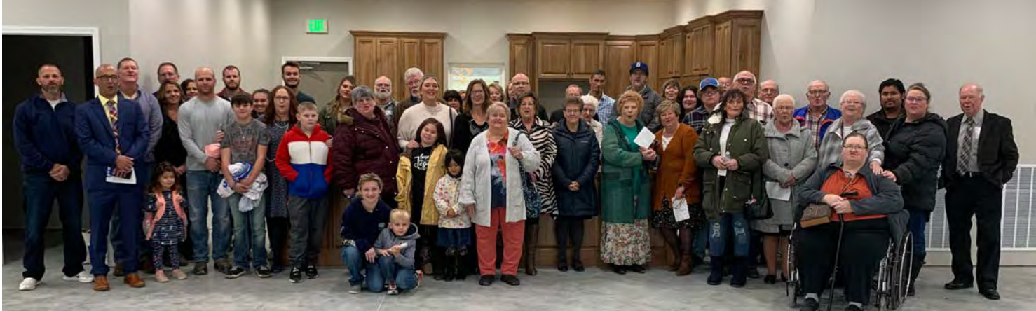
SWID's Christmas Banquet - December 4th