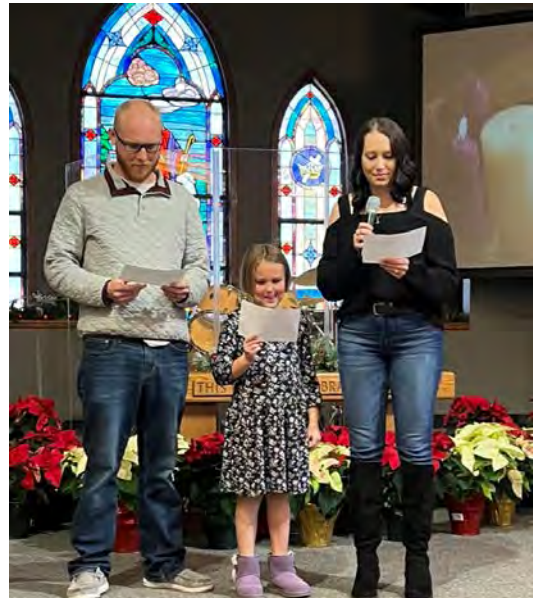
Restoration -Advent Wreath