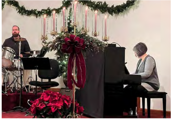
Oakland City,-Advent Service