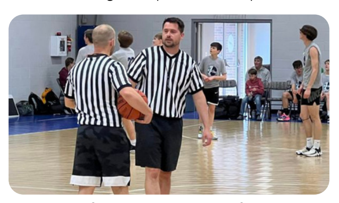
The referees at Celebrate Life were showing off the legs!