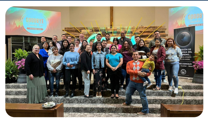
The congregation at Shalom Hispanic COTN