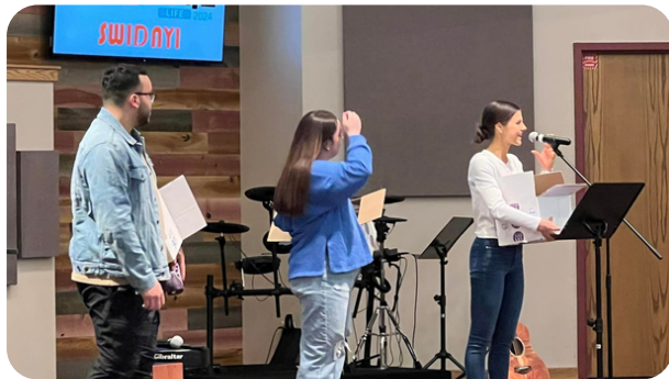
District Celebrate Life @ Nashville Parkview