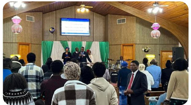
The congregation at Evansville Beacon in worship