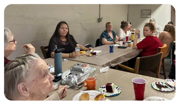
Fellowship with the growing congregation at Patricksburg Nazarene