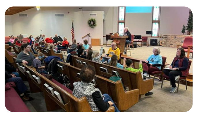
Recent Children's Quiz at Mackey Nazarene