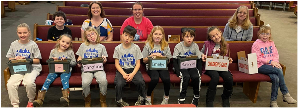
Some kids quizzers from the Mackey South Quiz!