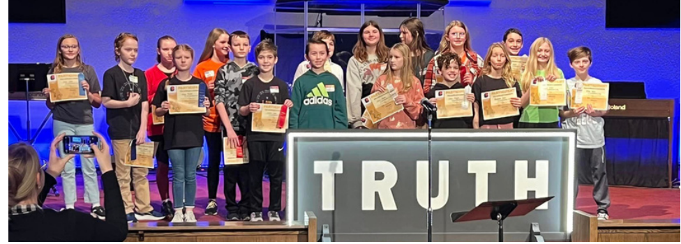
Some of our kids quizzers from the Terre Haute First North Quiz!