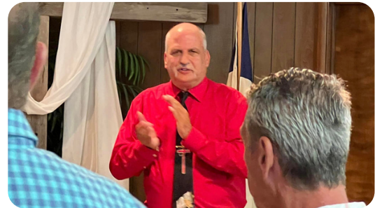
Rockport recently celebrated 100 years of ministry. To God be the Glory!