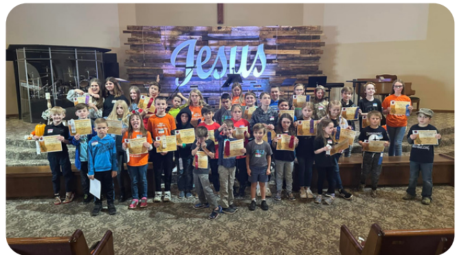
November North Kids Quiz @ Columbus First