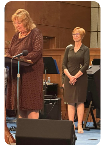
Bloomington First recently celebrated 100 years as a church!