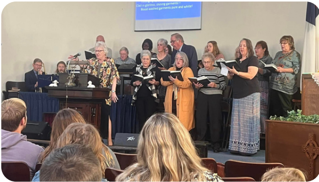
Celebrating 100 years at St. Bernice!