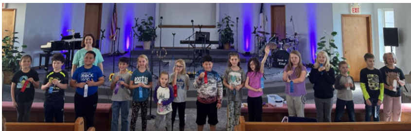
Our South District Quiz Kids at Point Township COTN. Proud of them!