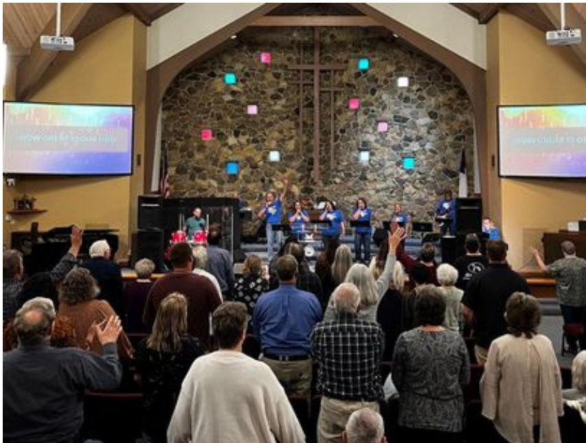
Terre Haute Zone Combined Worship @ Brazil