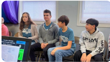
Teen Quizzing at Brazil