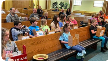
Children Quizzing @ Spencer Nazarene