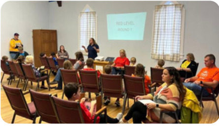
Children Quizzing @ Spencer Nazarene