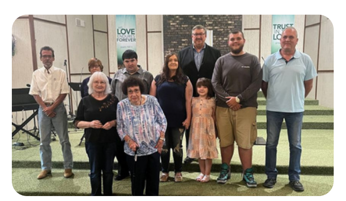
Eight new members were received into the Church of the Nazarene at Crothersville. Welcome!