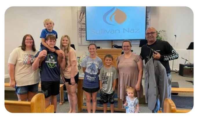
7 Baptised at Sullivan Nazarene. Praise the Lord!