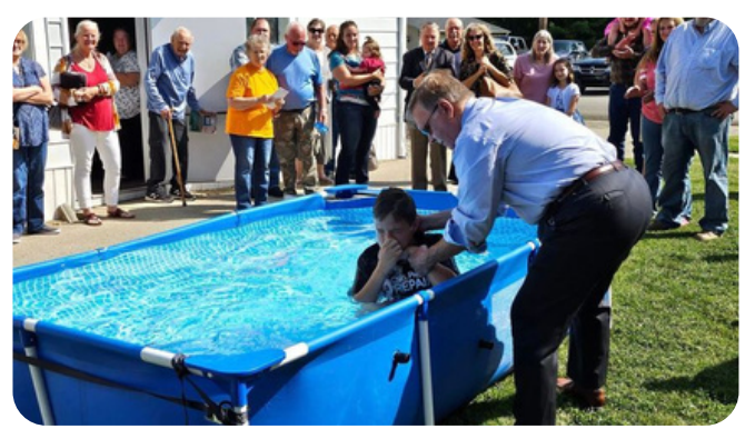
Celebrating New Life at Kurtz