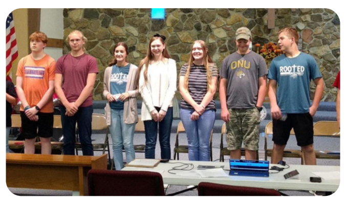
First teen quiz of the year at Brazil Nazarene