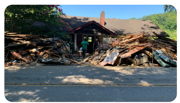
SWID Disaster Relief Team in East KY