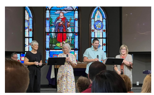
Worship at Restoration in Bedford